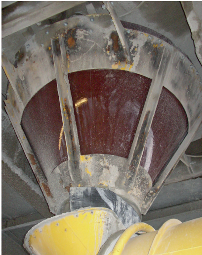
Special Coneflex® funnel from habermann materials.