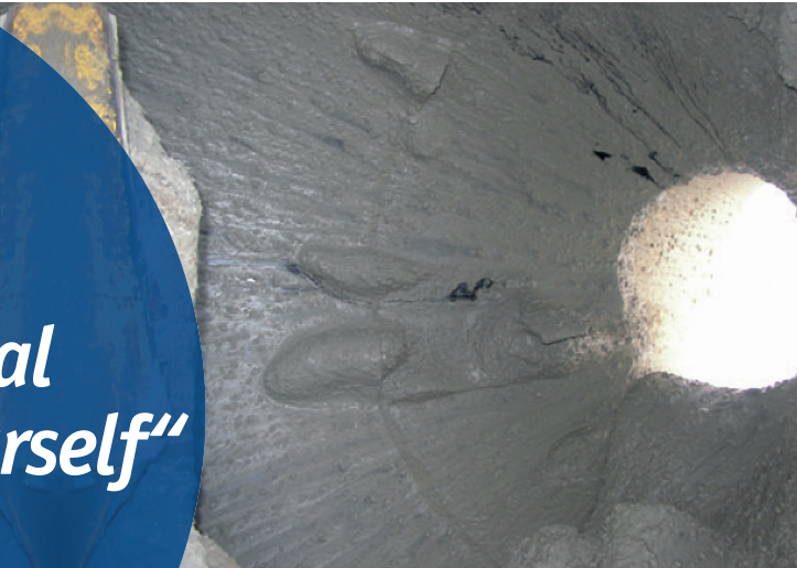
Fig. 1: Macerated rubber lining as result of release oil agent

repairs in concrete production facilities