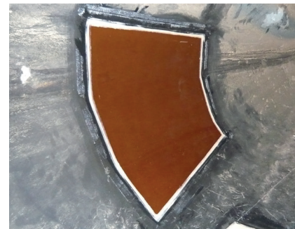
Fig. 4: Only one operation needed to fill a worn section with Hawipair® (white)