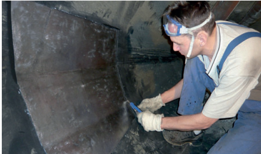
Fig. 3: Preparatory work for repairing the damaged areas